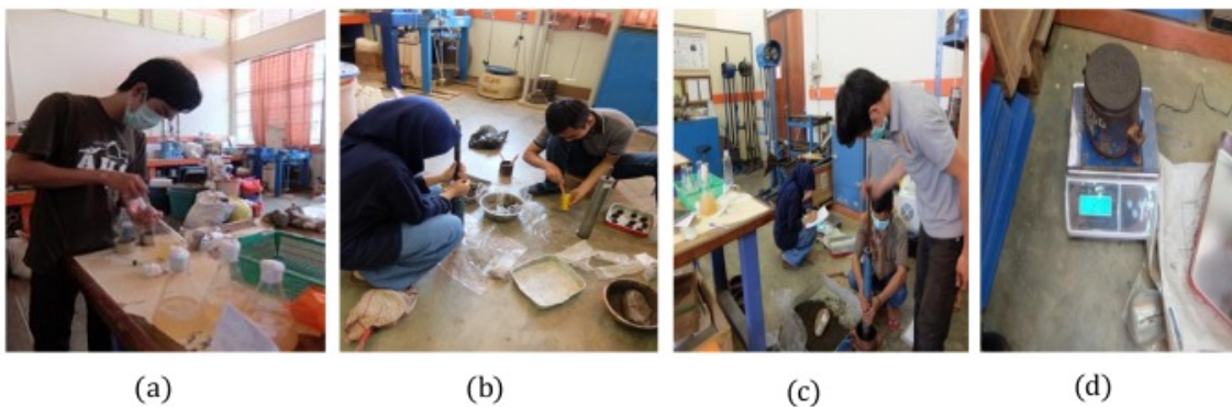
Fig. 2. Tests procedure: a) mixing the soil with bacteria , b) making of soil samples , c) compaction process, d) Weighing the soil samples

CBR measurements in this study were carried out by mixing the soft soil with water that matched the optimum moisture content of the Proctor compaction result and mixed with 2%, 4%, 6%, 8% and 10% bacteria solution, for the test after 7 days cured.